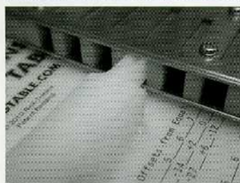
Einstein's Tuning Table

I found I could use both this tool and the draw scraper for extended